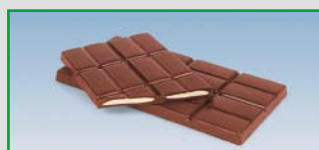
Long One-Shot tablets