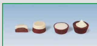
Double-Layer Power One-Shot